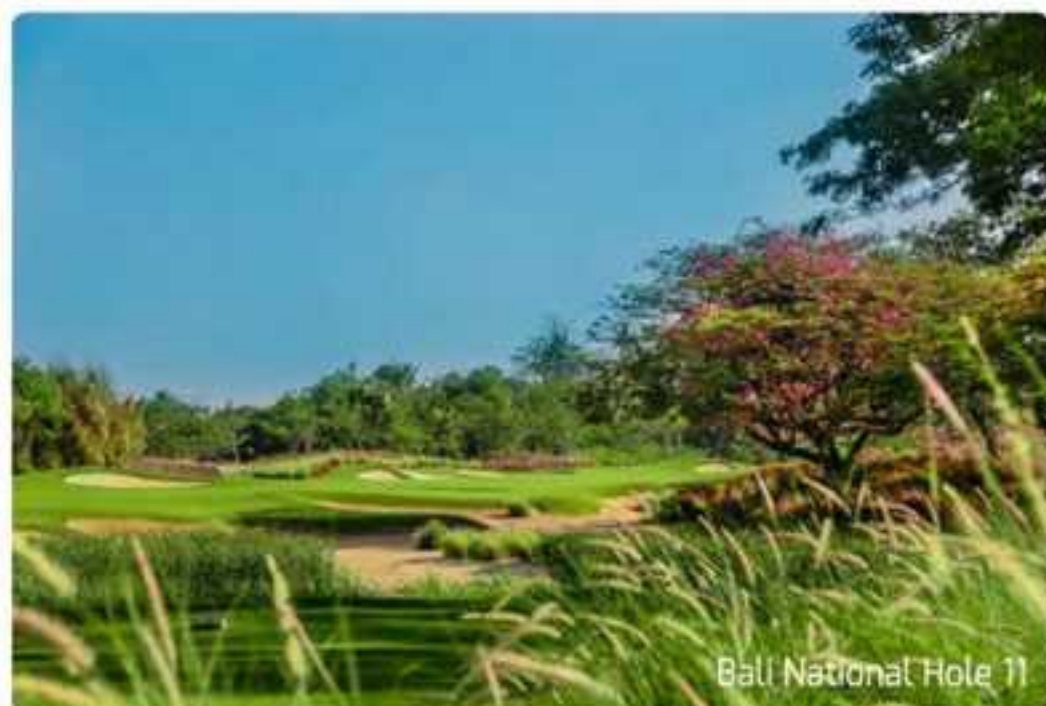
Bali National Hole 11