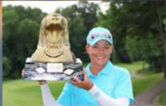
Wraps, In The Bag & Go Figure