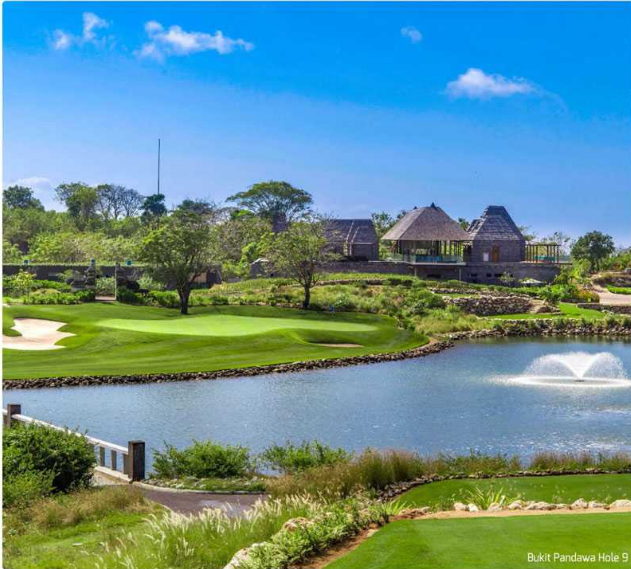
Bukit Pandawa Hole 9

short on challenge. The layout boasts 18 testing par-3s. The opening two holes measure 178 metres and 223 metres respectively. Both holes require a long iron or a wood to reach their distant greens.