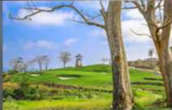
Bali—A Golfing Paradise