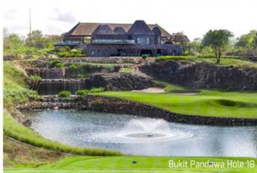
Bukit Pandawa Hole 18

Many who have enjoyed playing the course rate the 170-metre, 13th as the signature hole. And it's easy to see why. The hole plays slightly uphill to an undulating green which is framed by three bunkers. The long-iron tee-shot is struck over curved stonewalls in the foreground and toward the prominent ancient Balinese kul-kul tower behind the green. Watching your ball sail into the backdrop of the shimmering Indian Ocean completes the stunning scene.