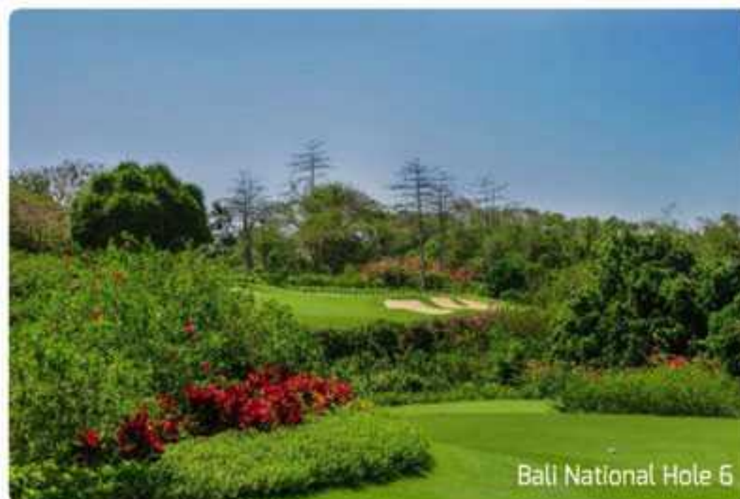
Bali National Hole 6

Golf Club as the 3rd Best Renovated Golf Course in the World 2015.