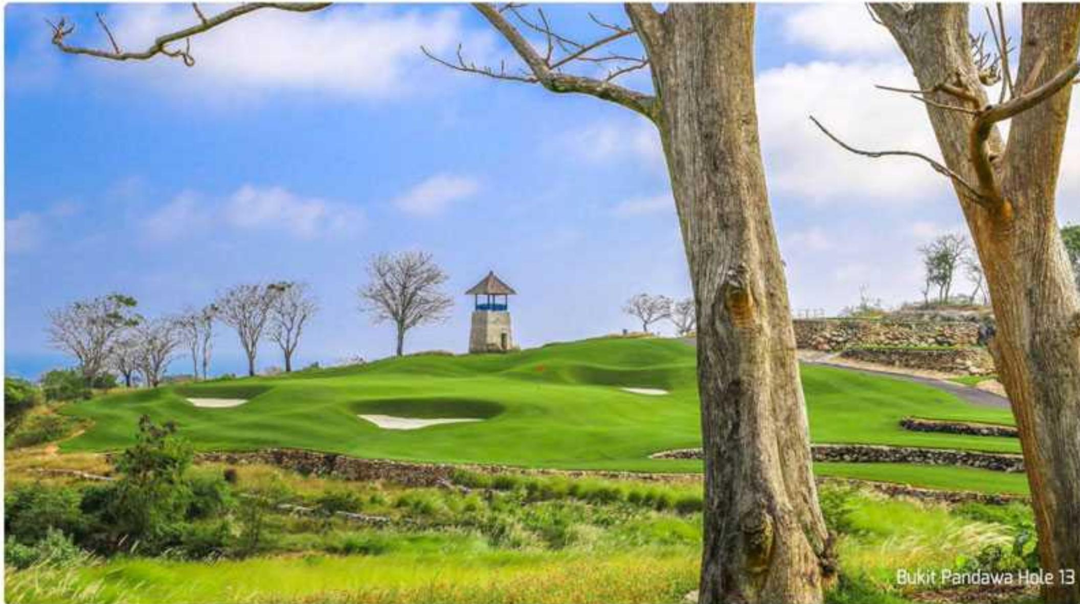
Bukit Pandawa Hole 13