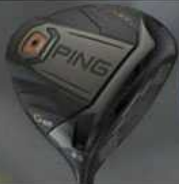
Callaway, Cobra Golf & Ping.