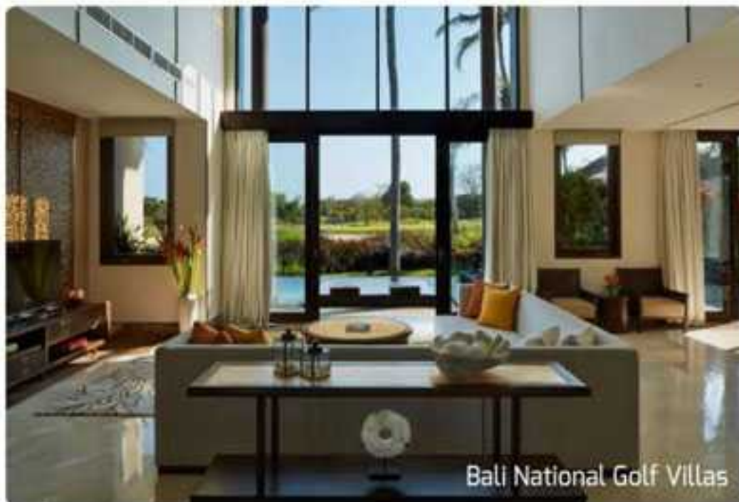
Bali National Golf Villas