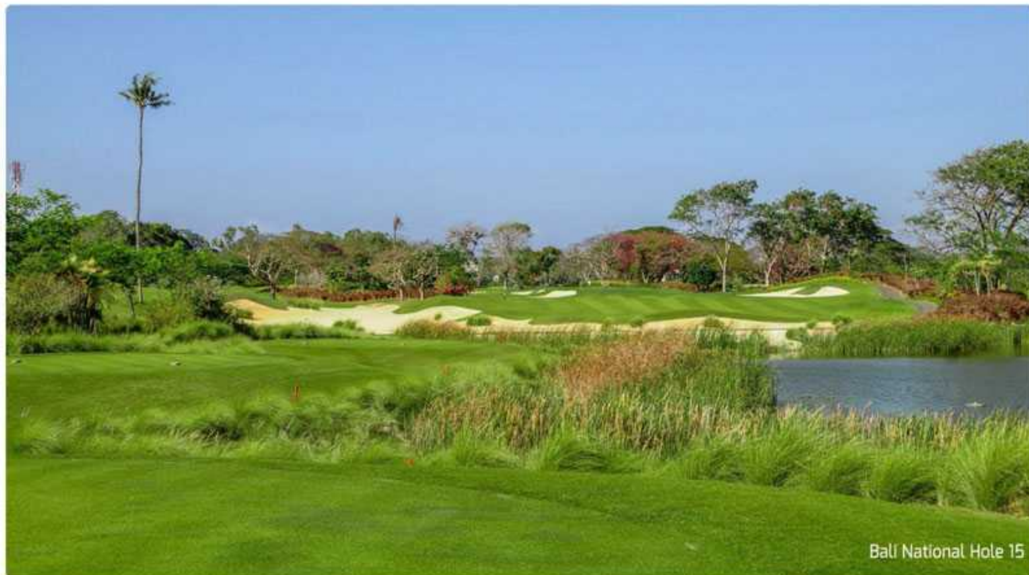
Bali National Hole 15