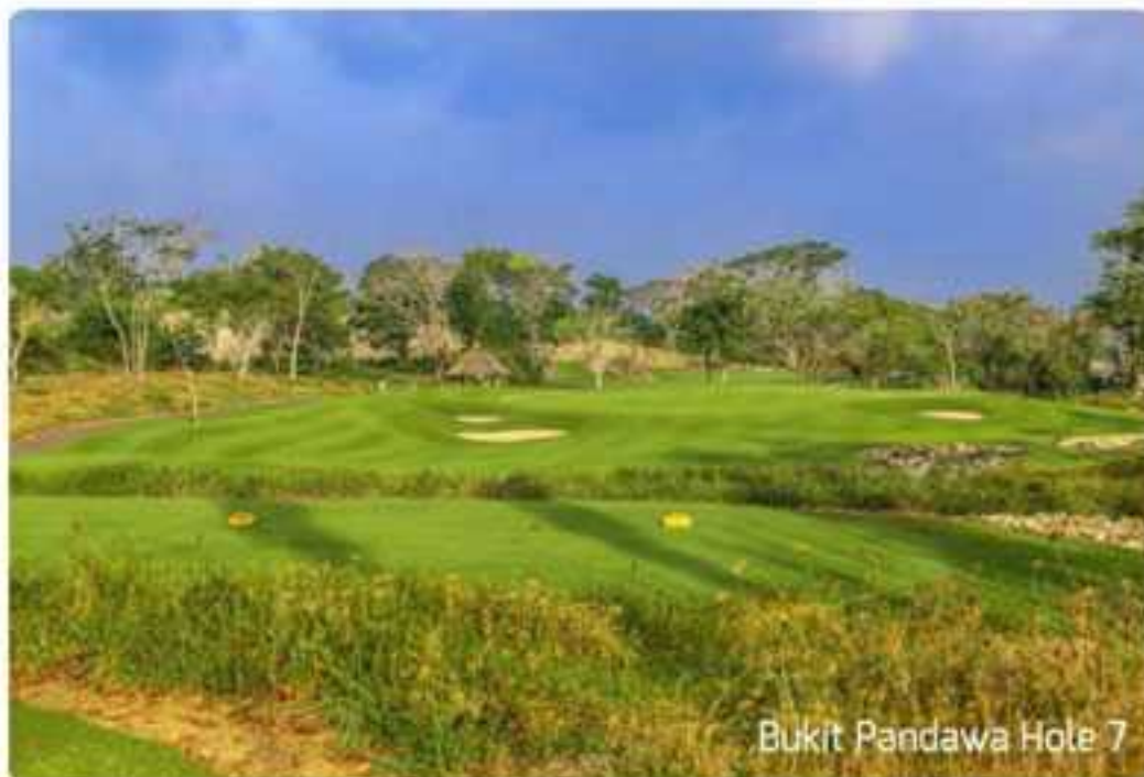
Bukit Pandawa Hole 7