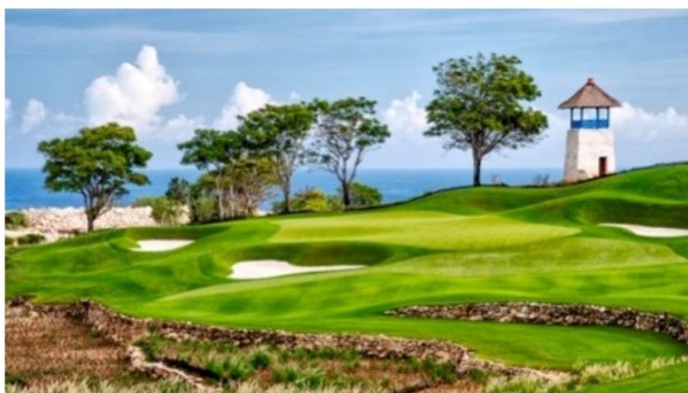
Hole No. 13, 148 yards, Bukit Pandawa G&CC, Bali, Indonesia

One standout hole is the 148-yard 13th, which is framed by three bunkers and features curved stone walls in the foreground and a traditional Balinese kul-kul tower in the background.