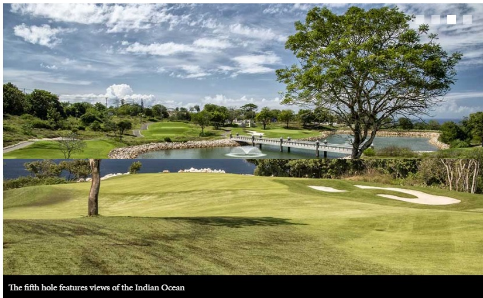
The fifth hole features views of the Indian Ocean